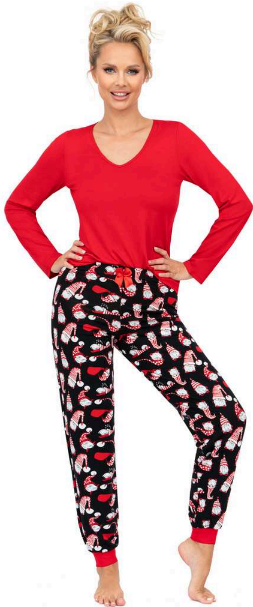
SANTI long red