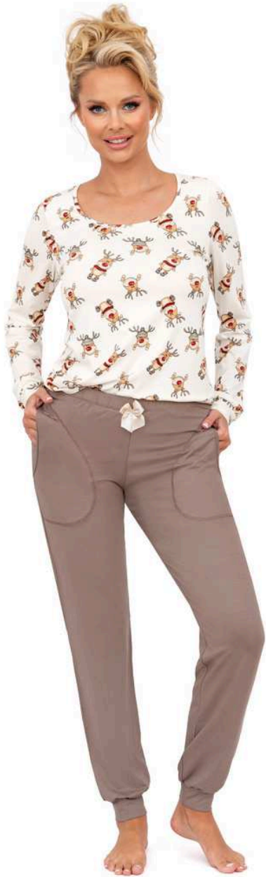
RENI long beige