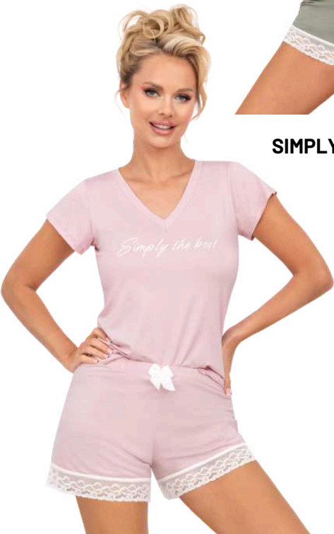
SIMPLY 1/2 powder pink

Size: S-XXL Composition: 95% viscose 5% elastane