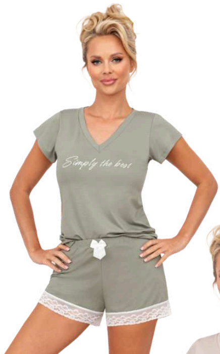
SIMPLY 1/2 olive