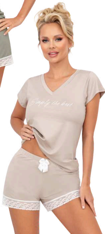
SIMPLY 1/2 beige