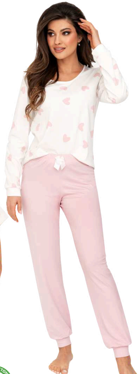
SWEET long powder pink